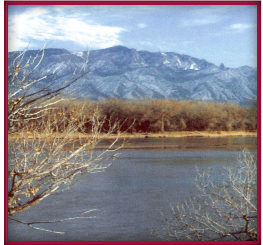
View from Coronado

The University of New Mexico Arthur A. Blumenfeld Memorial Lectureship UNM Foundation 2 Woodward Center 700 Lomas NE, Suite 108 Albuquerque, New Mexico 87131